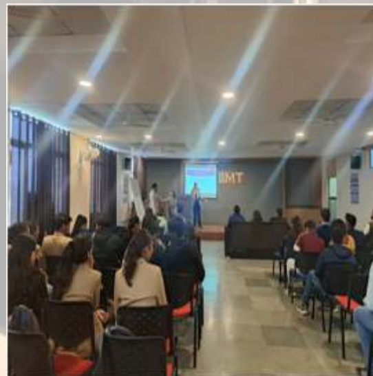
Ideation Competition In Progress