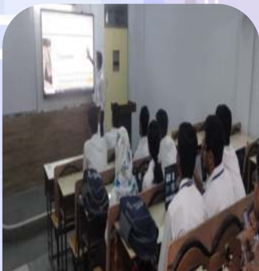
Idea Presentation Competition at ECE Department

The objective was to promote new innovative ideas and to develop the skills for becoming a successful entrepreneur.