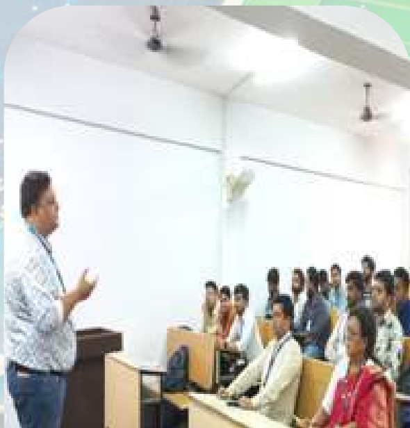
Guest Lecture on Industry Exposure and Market Trends