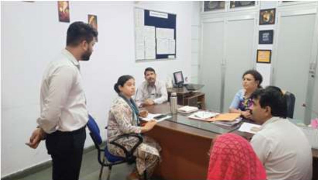
Parents -Teacher Meeting In Progress

ECE Department organizes Parents-Teacher Meeting, two to three times in each session. The main objective of this meeting is to assist parents in understanding the student's progress at the college and find solution to academic or behavioral problem, if any.