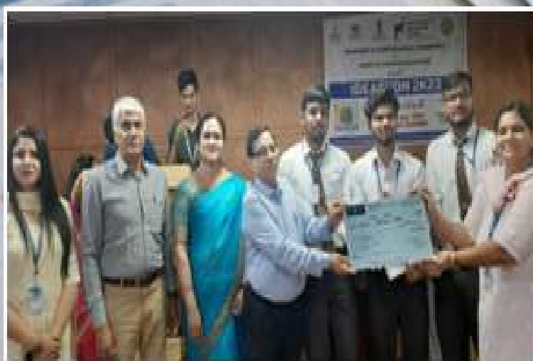
Award Ceremony of Ideathon Competition at Lingaya's Vidyapeeth, Faridabad