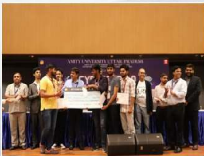
Award Ceremony Of Cyber Cup 3.0 at Amity University, Noida